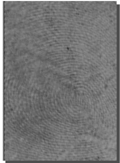
Image after pattern removal